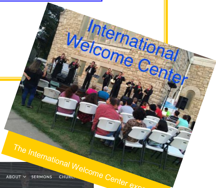
The International Welcome Center expands