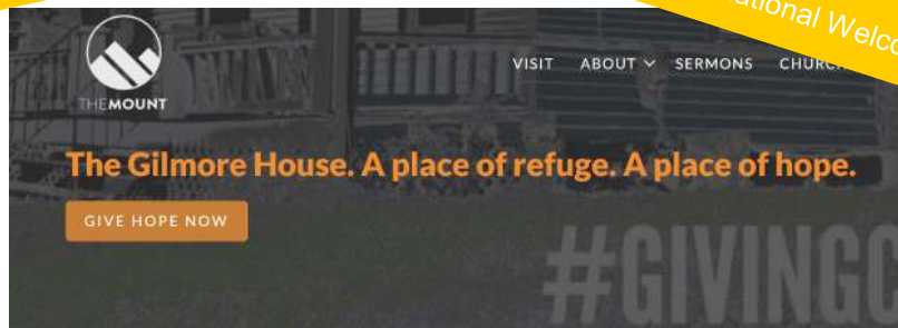
Mt. Washington works to open The Gilmore House