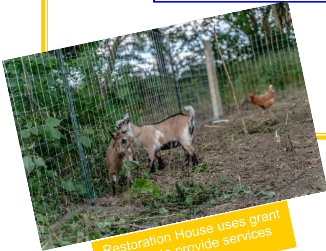
Restoration House uses grant money to provide services