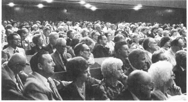
Close attention was paid by the large crowd that attended the first annual Blue River-Kansas City Association meeting.

Total attendance for the two nights of the Annual Associational Meeting was approximately 1,400. It was a great response to the first annual meeting of our Blue River-Kansas City Association! The audio-visual, "Our Association on Mission," was a thrilling presentation of many of the ministries of our churches and our association. Members of the associational staff worked diligently to put together this graphic picture of missions in our association.