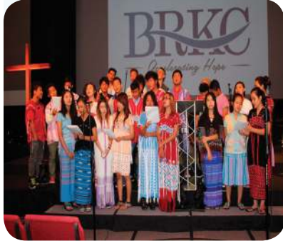
Burmese Youth Choir

BR-KC held its 34th Annual Meeting on October 4th at Noland Road Baptist Church with 400 in attendance. The international Missions Fair kicked the meeting into high gear. Messengers were able to learn more about various missions and ministries such as our partnerships with Vancouver, the Horn of Africa, MBCH, Restoration House and more.