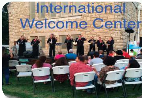
Grand Opening of the IWC at Palabra Viva in northeast Kansas City