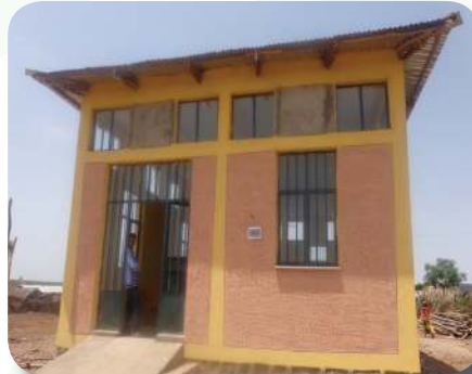
The new library for refugees in the Shimelba Camp