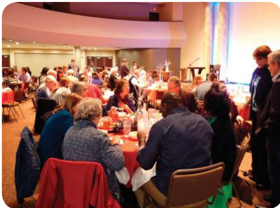
Our great crowd of pastors, staff and spouses