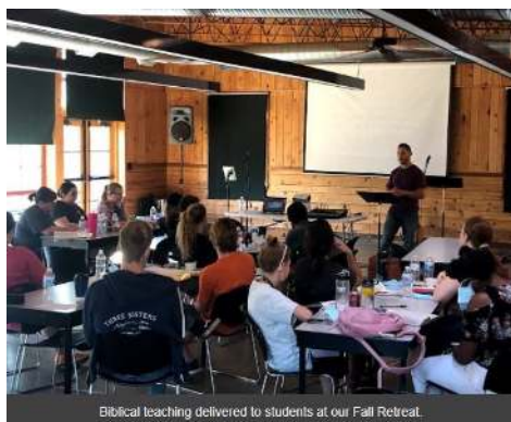
Biblical teaching delivered to students at our Fall Retreat.